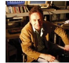
Jay: service is 'invaluable'

Jay explained: "The site was conceived as a journalists' tool as there is no need to go to the various news websites each day. I wanted to build a one-stop tool that would allow me to keep up to speed each morning while I enjoyed my breakfast hands-free."